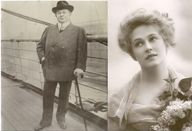
Charles Frohman and Pauline Chase