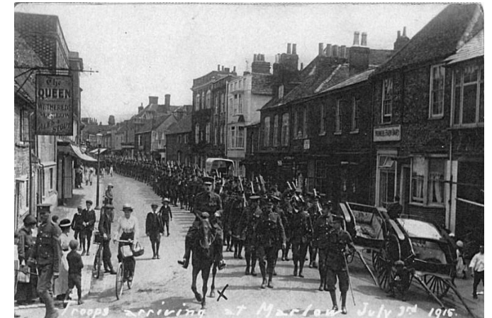
Troops arriving in Marlow, July 3 rd 1915