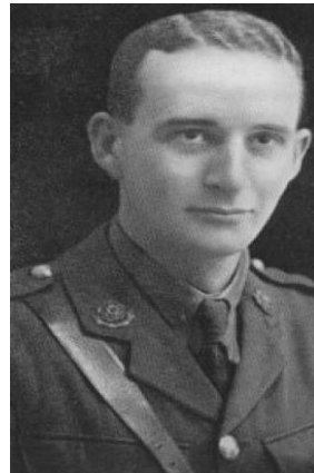
2 nd Lt Basil Horsfall VC