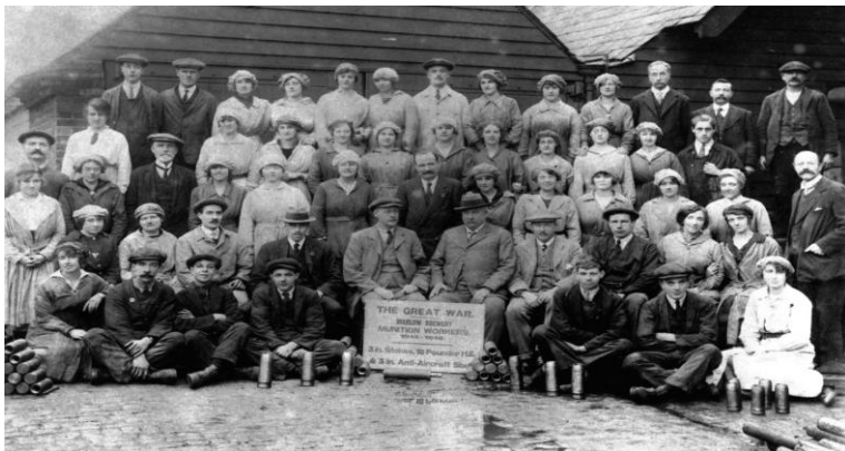
Brewery munitions workers 1918